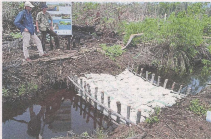
Canal blocking to restore peat swamp's high water table is part of efforts to preserve the unique forests.