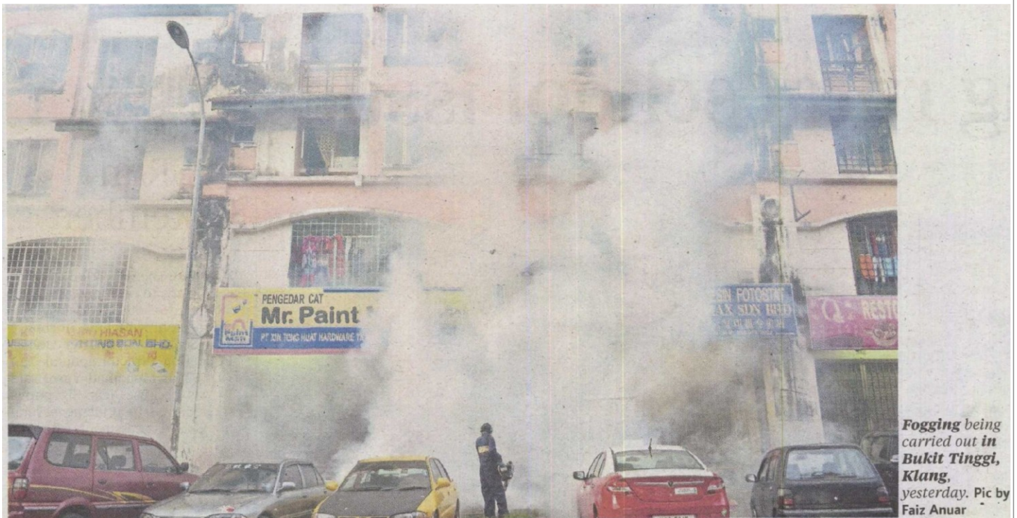
Fogging being carried out in Bukit Tinggi, Klang, yesterday.