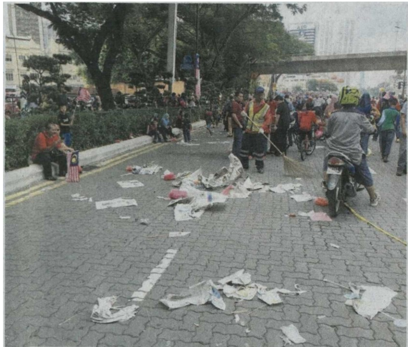
LANCAH membanteras tempat pembiakan nyamuk aedes masih gagal berikutan tabiat rakyat yang pengotor seperti dipamerkan selepas perbarisan Hari Kebangsaan 2016 di Kuala Lumpur pada Rabu lalu. - GAMBAR HIASAN/IHSAN DBKL