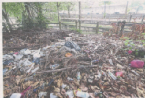
Heaps of rubbish left around the Astaka field.

During a visit by StarMetro , the carpark closer to Lorong Utara Kecil was seen used as a temporary hub