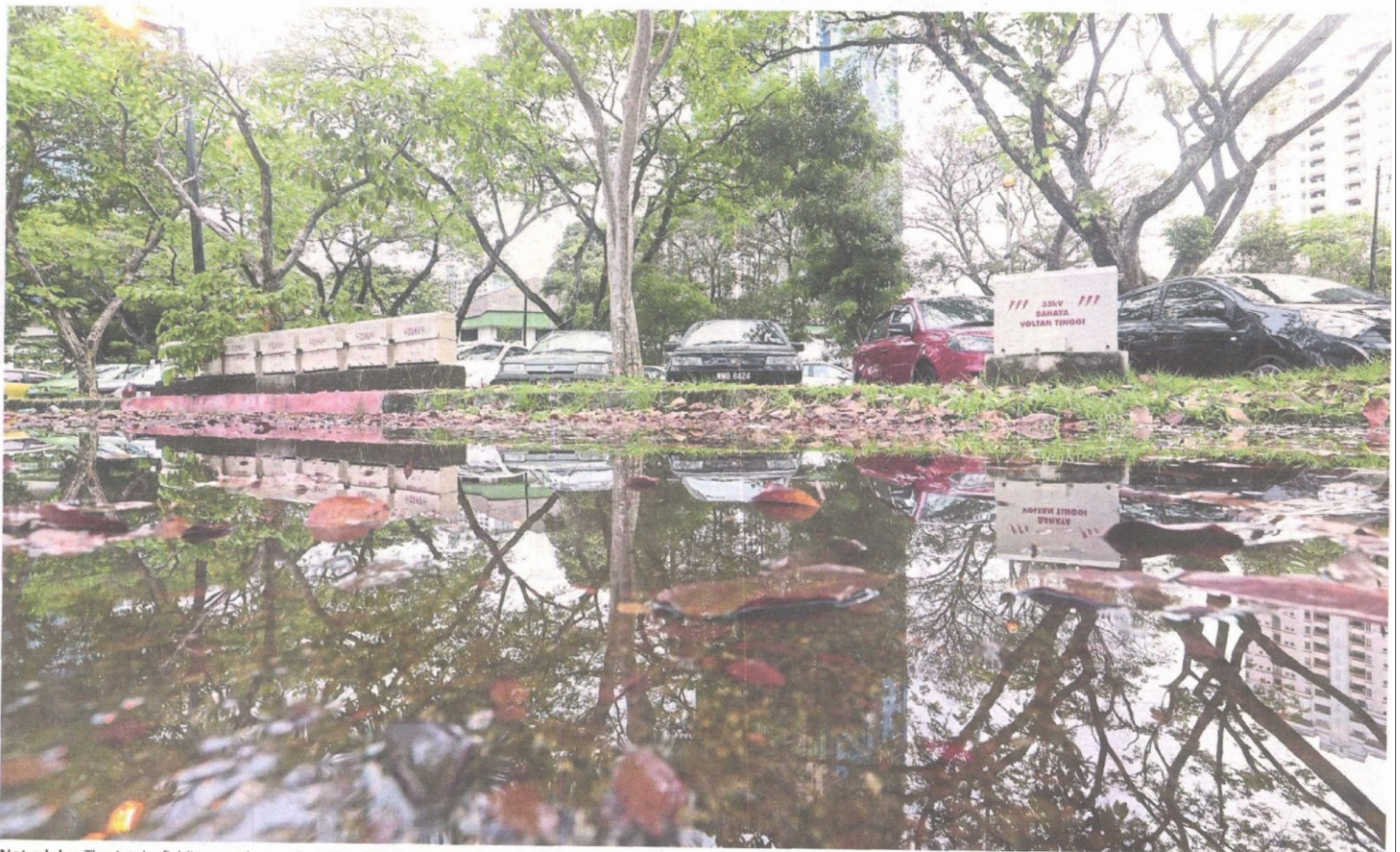
Not a lake: The Astaka field's carpark near the Cobra Club in Petaling Jaya gets flooded easily as the drains are clogged and rarely cleaned.

Recreational field in Petaling Jaya has become a dumping ground and its facilities have not been maintained, making it a health hazard to users. >2&3