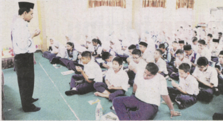
Seramai 125 calon UPSR 2016 Sekolah Kebangsaan Pelabuhan Klang mengaminkan doa sebelum menduduki peperiksaan itu, semalam.

SHAH ALAM - Jumlah calon Ujian Pencapaian Sekolah Rendah (UPSR) 2016 meningkat 0.35 peratus berbanding tahun lalu.