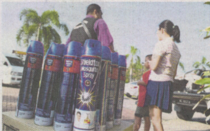
PENYEMBUR nyamuk diedarkan kepada penduduk pada Program Gotong-Royong Kebersihan di Ambang Botanic, Klang.

"Ia terbukti apabila kita dan PKD menemui 15 tempat pembiakan yang di-khuatiri mengundang kepada wabak denggi," katanya.