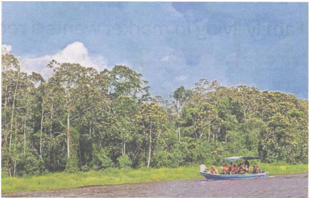
The development of ecotourism at peat swamp forests can create an alternative source of income for local communities.