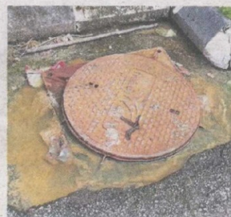
The manholes overflow every day, leaking onto the streets, contaminating the area and posing health risks for residents and the public.

At the meeting, a representative of the developer promised to fix the water treatment plant and other problems within two days of