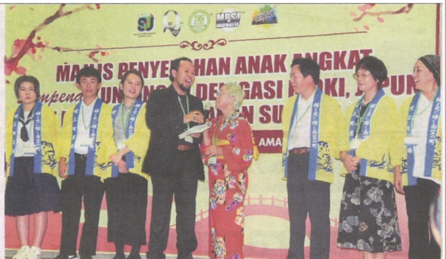
Each of the 11 delegates who arrived in Subang Jaya under the cultural exchange programme introduced themselves and shared what their expectations were of the trip.

The 11 delegates also put up their own show by performing a traditional dance called Ohara