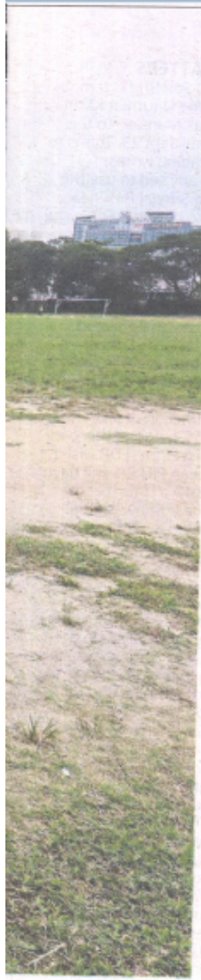
1 The Astaka field in Petaling Jaya was last upgraded in 2014 and it cost the council RM800,000. The upgrade consisted of returfing and maintenance works. However the field has since deteriorated. There are bald patches on the field.