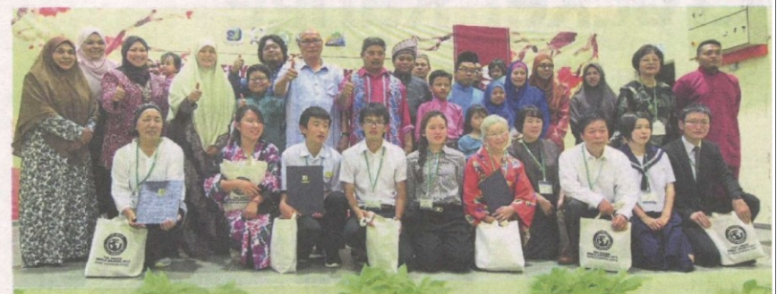
The 11 delegates from Hioki City who lived with families in Kampung Sri Aman, Puchong, for three nights to experience Malaysian culture.