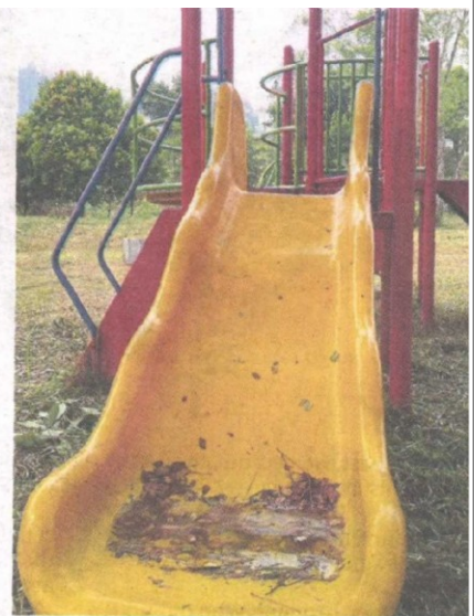
Stagnant water on the slide at the recreational park in Taman Bukit Mulia, making it unusable for children to play. — SHALINI

"For the next stage, MPAJ will pressure DID to deepen the pond as the water floods the playground area when there is a downpour," he said.