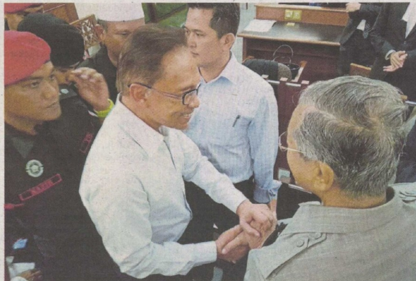
DR Mahathir bersama Anwar di Mahkamah Rayuan Kuasa-Kuasa Khas, Mahkamah Tinggi Kuala Lumpur, semalam.