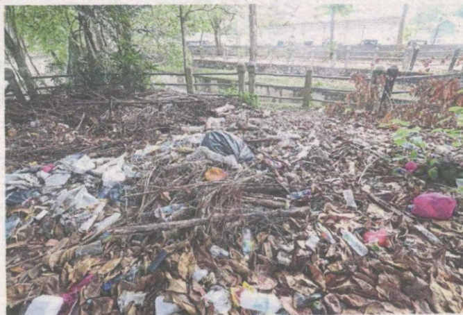
Heaps of rubbish left around the Astaka field.

During a visit by StarMetro , the carpark closer to Lorong Utara Kecil was seen used as a temporary hub