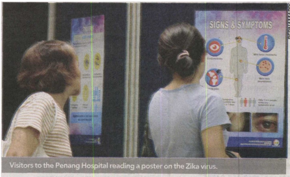
Visitors to the Penang Hospital reading a poster on the Zika virus.